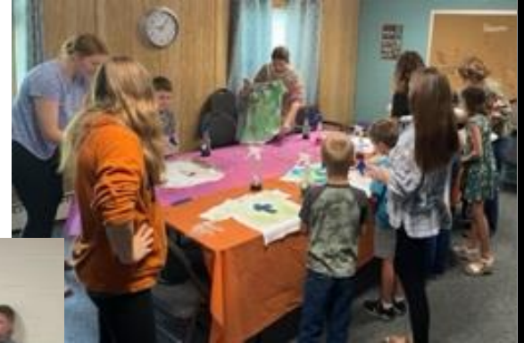
Sunday School tie-dyeing t-shirts