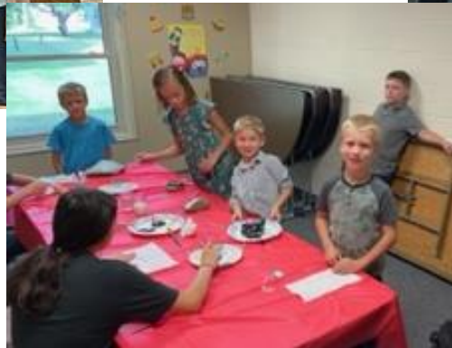
Painting rocks for our Kindness Rocks Garden