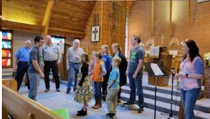
Some of the Sunshiners 4H Club Presenting a check totaling $1050 to the Carpio Council as a thank you for allowing the club to use their church for their monthly meetings