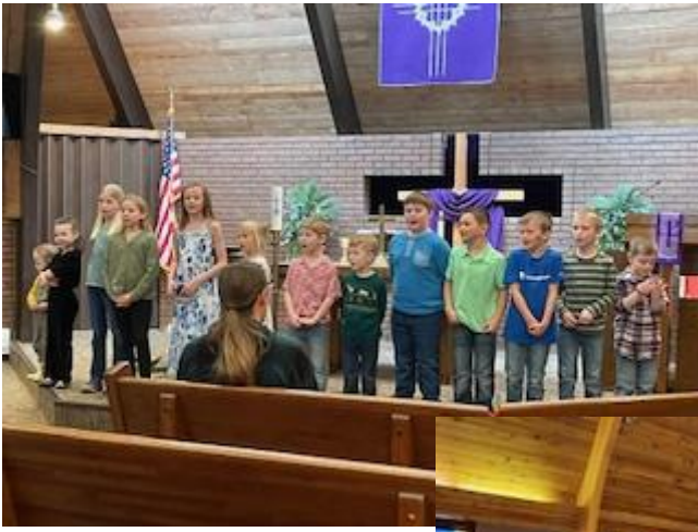
Zion Sunday School Singing on Palm Sunday