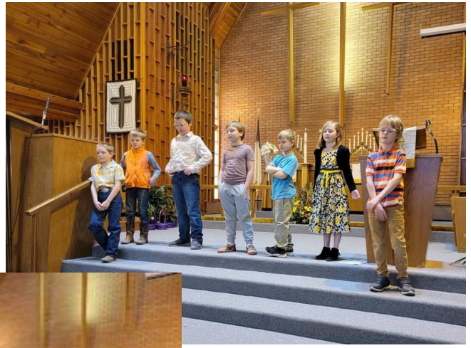
Carpio Sunday School doing their Easter Program "The Empty Egg"